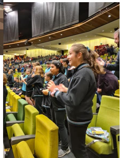
National Young Leaders