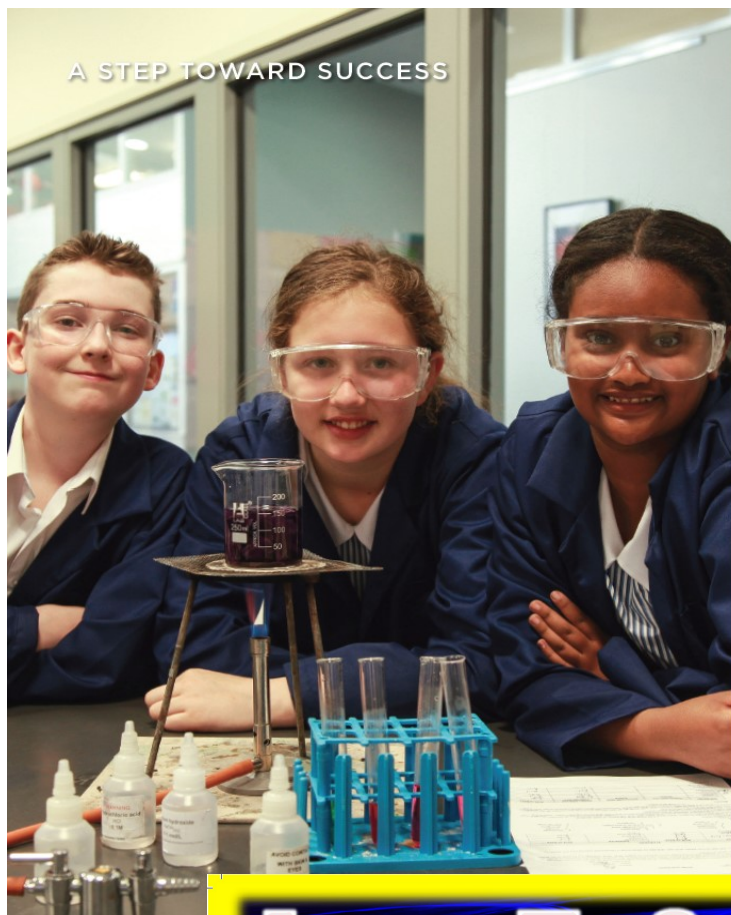
A STEP TOWARD SUCCESS